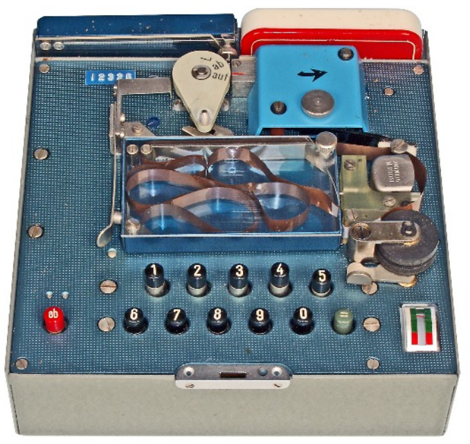
Geber E (early model)