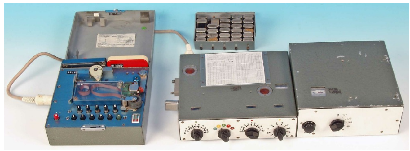
Geber E (early model) used with SE 25 transmitter (centre) and associated type NE 25 mains power unit. Behind the SE 25 a box with other operational crystals.

It is speculated the Geber E was a further -more advanced- development derived from Czech Dávač and Měsíc high speed keyers which operated on the same principle. (See Chapters 75 and 76)